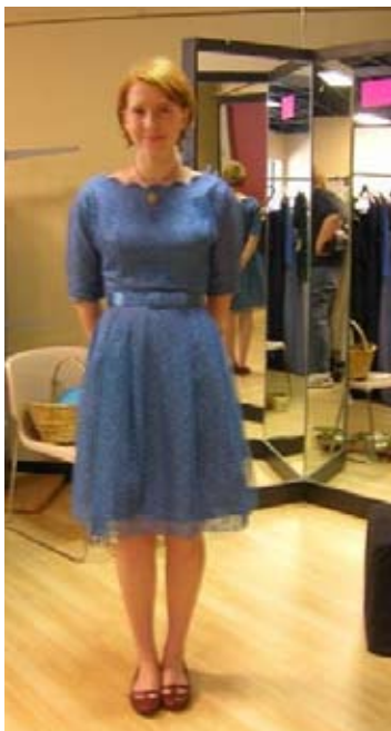
A shopper with her special vintage dress find.