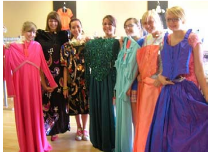
my closet Homecoming Dress Sale shoppers and their vintage dress finds.

Thanks to all who helped plan, put on labels, created coupons, set up racks, cleaned, tagged, greeted shoppers, stood on the street holding signs, ordered food, hung clothes, brought balloons, donated jewelry, donated clothes, dressed mannequins, undressed mannequins, ran to the bank, steamed clothes, placed